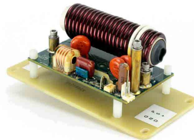
Remote Short-Pulse Igniter