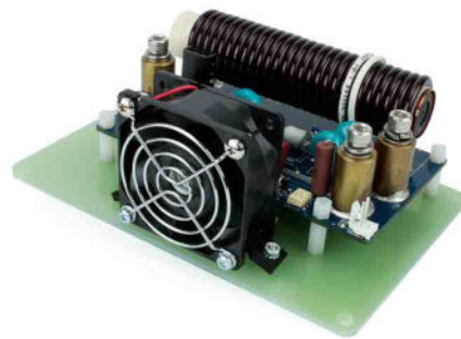
Remote Short-Pulse Igniter